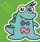
Nissy, the mascot of Nisshin